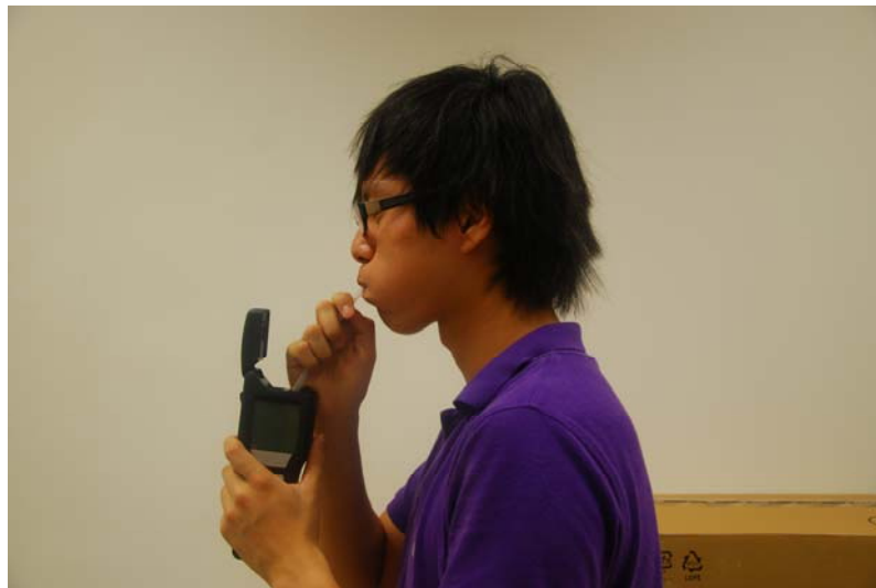
Figure 3. The integration of microsensors, piezoresistive transducer, air sampling and integrated circuit systems provide a portable and field-deployable monitoring device for breath diagnosis.

圖2. 微型懸臂電壓傳感器組合塗上不同分子印跡聚合物，檢測呼吸中不同的目標分子。懸臂的重量增加會導致傳感器變位或共振變寬，因此有兩種操作模式：靜態模式和動態模式。